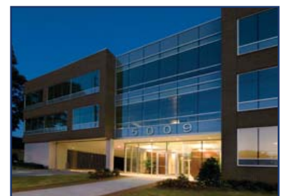
5009 Roswell Road