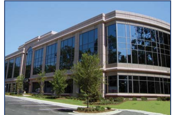
Halcyon Point Buildings B and C

Conway & Owen provided M/E/P services for two three-story, 75,000 square foot Class "A" office buildings with shell and core. Additional projects included the second floor tenant fit-ups for Morgan Keegan and the Alabama Housing and Financing Authority.