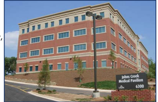
John's Creek Medical Office Building

Conway & Owen provided M/E/P services for this new 93,500 square foot, four-story medical office building shell and core.