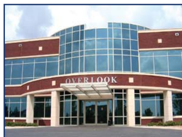
Overlook Medical Office Building