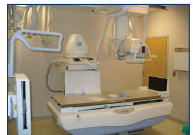
Grady Memorial Hospital