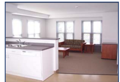
College of Charleston