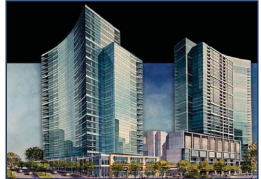
Metropolitan Residential Tower

A new 425,000 square foot, 35-story residential tower including apartments, retail, amenities, and an enclosed 10-level, 625,000 square foot parking deck.